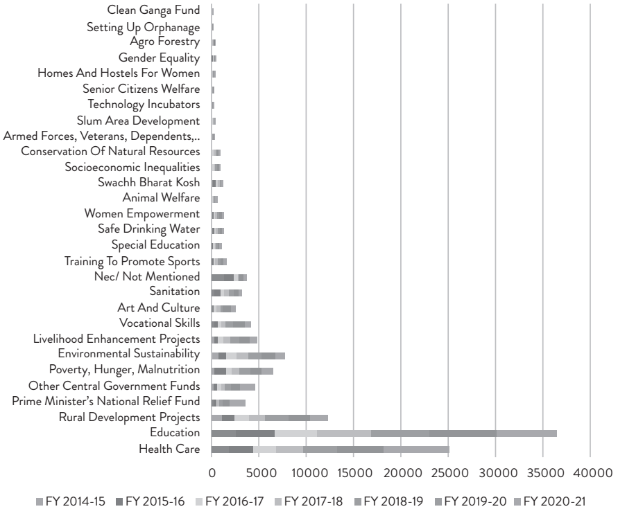
Figure 2: What gets funded? CSR amount spent (₹ CR.)